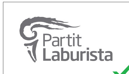
5. Partit Laburista greyscale logotype on a white background.