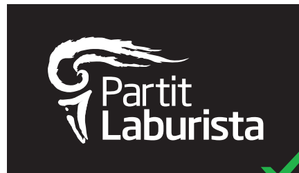
2. Partit Laburista logotype on a black background.