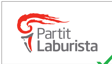
1. Partit Laburista logotype on a white or light coloured background. (recommended)