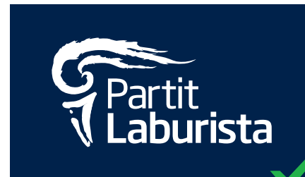
3. Partit Laburista logotype on a dark background.