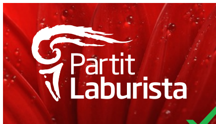
4. Partit Laburista white logotype on an image.