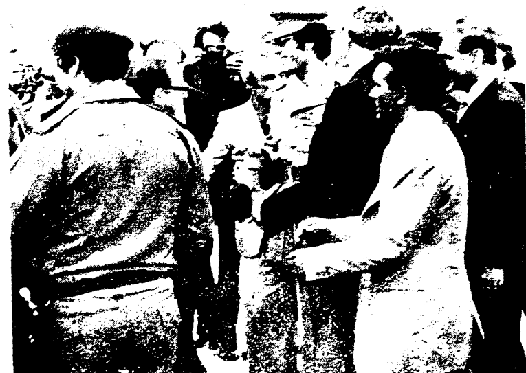
Colonel Gaddafi, President of Libya (in uniform) being greeted by Mr. Mintoff. Next to Col. Gaddafi is President Buttigieg.