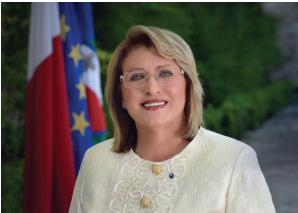
Her Excellency Marie-Louise Coleiro Preca President of Malta

It is indeed an honour for Malta to be hosting the first Women's Forum as part of the Commonwealth Heads of Government Meeting. Convening a Women's Forum shows the Commonwealth's commitment to giving recognition to the role of women in society today, and should highlight the opportunities for the often untapped potential of women to the socio-economic agenda and their competence as leaders. The empowerment of women is adamant to the development of an equal and just society throughout the world.